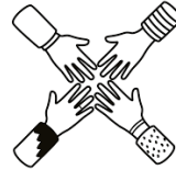
Inclusivity and diversity

Linking to our whole school vision, we have defined what the aims of our curriculum are for every child. These are: