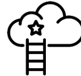
Ambition and aspiration