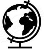
Our community: The Wider World