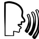
Every voice counts